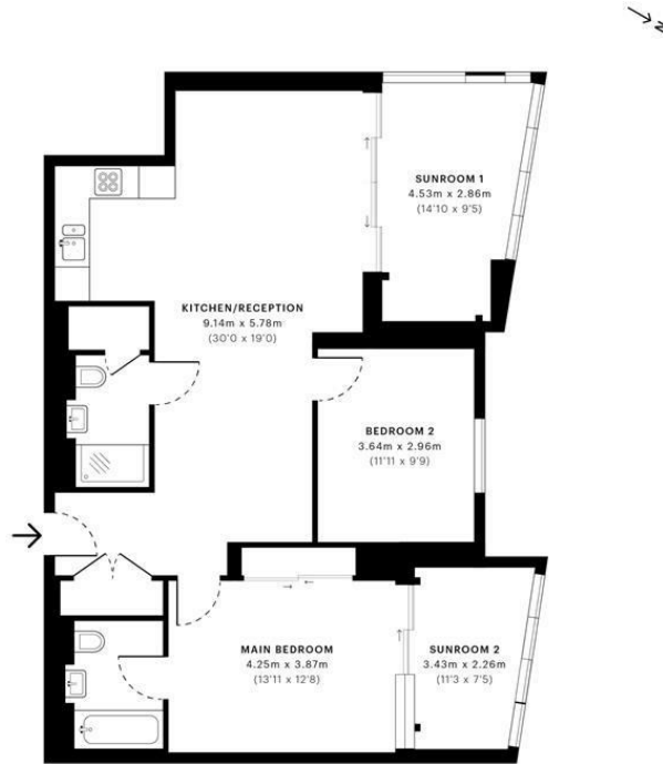
— Eleventh Floor

GROSS INTERNAL AREA (GIA) The footprint of the property 100.14 sqm / 1077.90 sqft